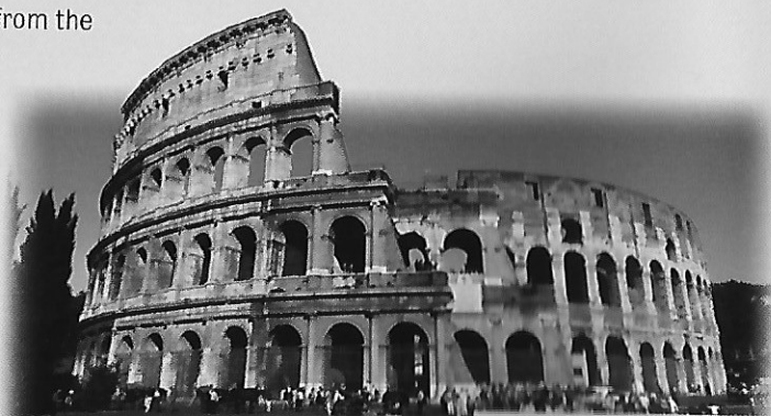
The Colosseum, Rome Built: 72-80 AD