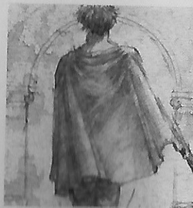
f _ _ o n _ _

2 Complete the sentences with the words in the tiles.