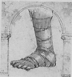
d _ a _ _ a _ e