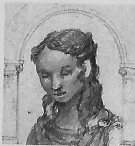
c _ _ u _ _