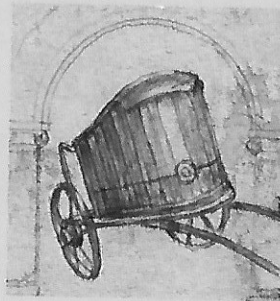
b _ _ a _ i o _