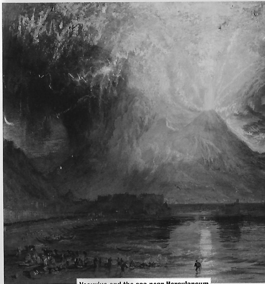
Vesuvius and the sea near Herculaneum